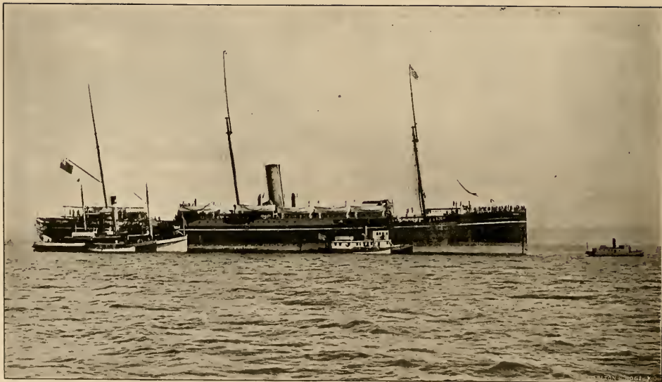
ARRIVAL OF THE KANSAS RECEPTION COMMITTEE AT THE TRANSPORT TARTAR.